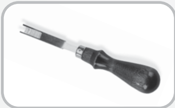
Rough Top Belt Skiver