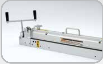
900 Series Belt Cutter