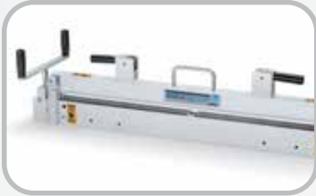
845LD Belt Cutter