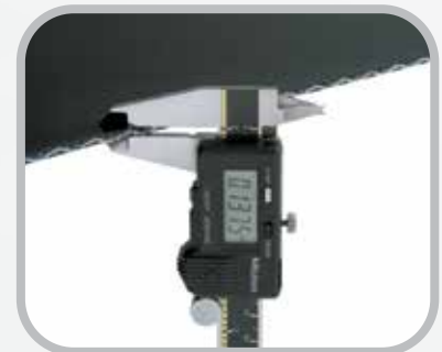
Measure belt thickness.