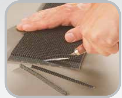
Skive impression cover.