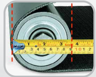
Measure smallest pulley diameter.