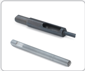
Belt Punch & Curling Bit

Alligator® Spin-Set Installation Tool Portable tool simplifies plastic rivet installation anywhere within your facility. Weighs only 30 lbs (14 kg), aligns fasteners automatically and holds them firmly in place while rivet heads are spin set into countersunk pockets.